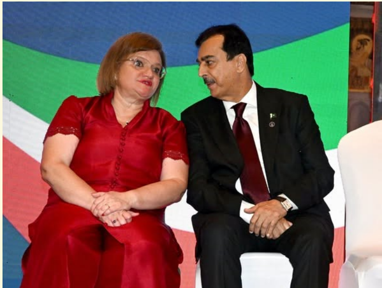
Among the distinguished guests were Yousaf Raza Gilani, Federal Minister Khawaja Muhammad Asif,

ments and joint initiatives. Both countries have increasingly focused on expanding commercial ties and encouraging business-to-business partnerships to unlock new economic opportunities. Participants observed that the relationship continues to gain strength amid growing global economic and geopolitical challenges, with both sides expressing interest in enhancing collaboration in areas linked to sustainable development, energy transition, technological innovation and climate adaptation. The National Day celebration thus served not only as a commemoration of Italy's national occasion but also as a reflection of the enduring friendship between Pakistan and Italy and their shared determination to build a stronger, broader and more future-oriented partnership in the years ahead.