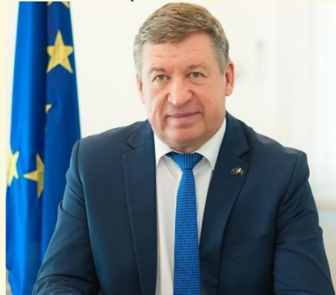
Ambassador of the European Union to Pakistan H. E. Mr Raimundas Karoblis

Brussels: The European Commission this week unveiled two new legislative proposals aimed at simplifying regulations, reducing administrative burdens and strengthening the competitiveness of businesses across the European Union. The measures form part of the Commission's broader drive to streamline EU rules, encourage investment and support economic growth while maintaining high standards of consumer, environmental and social protection.