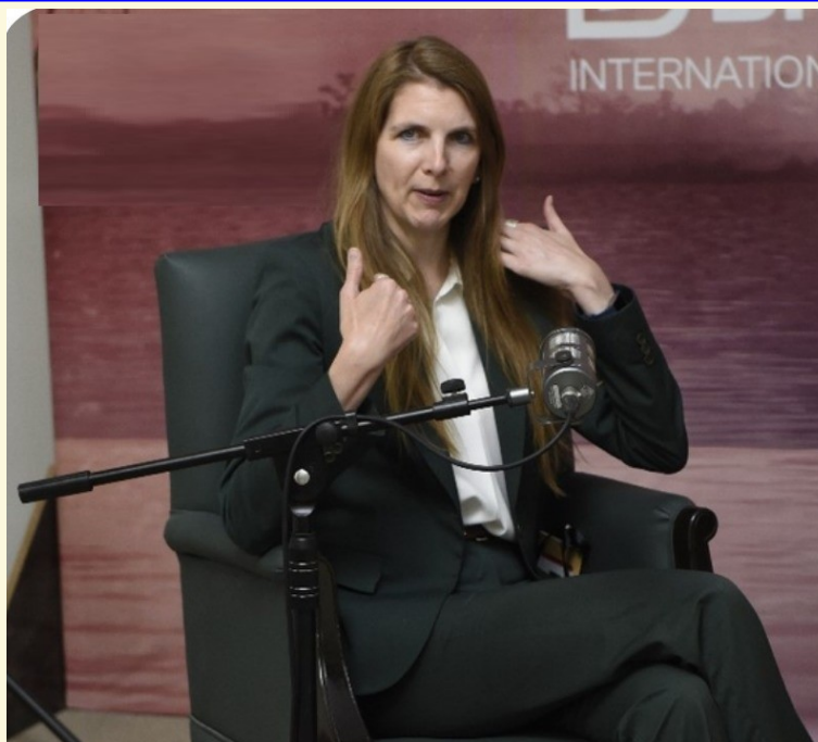
High Commissioner of United Kingdom to Pakistan Jane Marriott

annual horse-racing event since 2023. Catherine had stepped back from public engagements after being diagnosed with cancer in early 2024 and subsequently undergoing successful chemotherapy