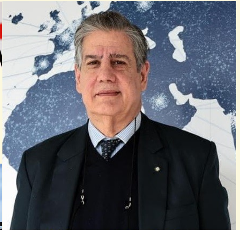
Leonardo's chairman H.E. Stefano Pontecorvo

warfare systems. The AW249 features an open architecture design and advanced digital systems, including a large-area cockpit display, modern control interfaces, and an integrated battle management system. These upgrades are intended to reduce pilot workload and improve decision-making in complex operational environments. A key feature of the helicopter is its ability to operate in coordination with unmanned systems. The AW249 is designed for crewed-uncrewed teaming, allowing it to integrate drones and other airborne assets to extend surveillance, targeting, and operational reach while reducing risk to the crew. Leonardo also emphasises survivability enhancements, including defensive systems, armour protection, sensor fusion, and electronic warfare countermeasures, designed for operations in heavily contested airspace.