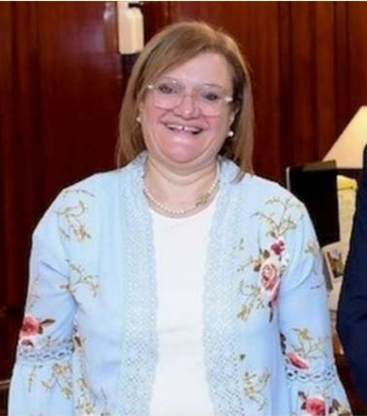
Ambassador of Italy to Pakistan, H.E. Marilina Armellin

Newswire Rome: Italy awakens a special magnetism when explored as a family. The country offers a blend that is hard to find elsewhere: living culture, natural landscapes that seem painted, and cities steeped in history. Each stage of the journey becomes an opportunity to discover together, across generations, the essence of the peninsula. What begins as a simple getaway can turn into a