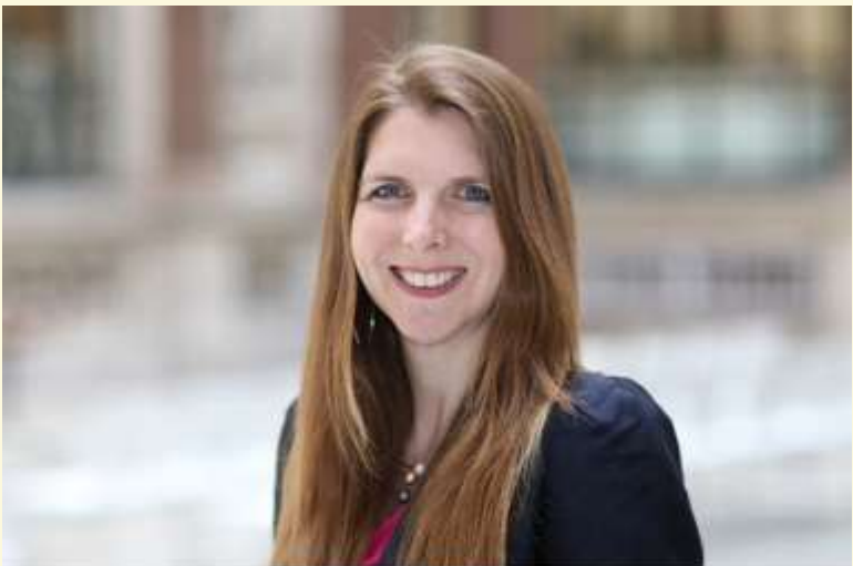
British High Commissioner to Pakistan, Jane Marriott

Covert Report London: The Mayor of London, Sadiq Khan, was formally knighted by King Charles in a ceremony at Buckingham Palace this week. The 54-year-old Labour politician received the honour in recognition of his political and public service. Sir Sadiq Khan has said that he and the King discussed which of them is "a bigger workaholic" as he received a knighthood for political and public service. Sir Sadiq, who has served as Mayor of London since 2016, was awarded the knighthood after being named in the New Year Honours list. Speaking to a media outlet, he said, "I have had the pleasure of working