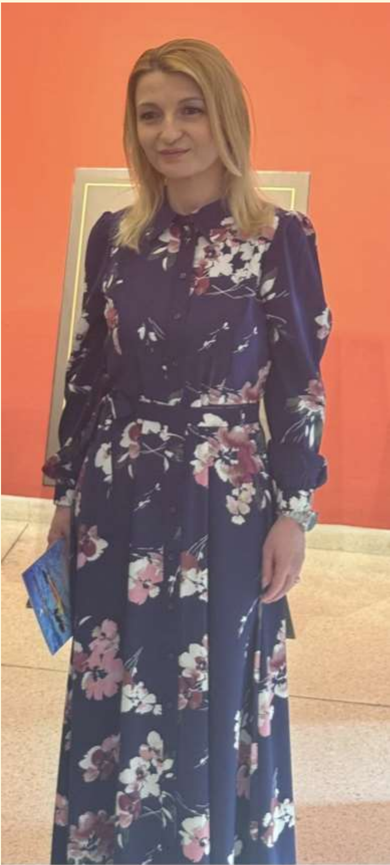
Bulgarian Ambassador to Pakistan H. E. Irena Gancheva

attract investment, and give Bulgaria a voice in eurozone decision-making.” Following the assessment, the Commission adopted proposals for a Council Decision and a Council Regulation for Bulgaria’s euro introduction on 1 January 2026. The final decision lies with the Council of the EU, following consultations with the Eurogroup,