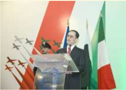
various aspects of strong and friendly