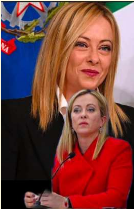
The first lady of Pakistan, Aseefa Bhutto Zardari, attended the event with Pakistan Peoples Party Women Wing President Faryal Talpur, Sindh Chief Minister Syed Murad