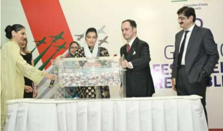
the Emirates Airlines and the Italian consulate for enhancing economic and commercial activities.