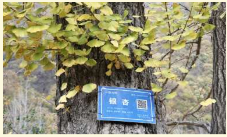
follows the principles of protection priority, "one tree, one strategy", and balanced

trees. The focus will be on strengthening technological support, enhancing the preservation and utilization of the unique genetic resources of Central China's ancient trees, actively promoting the application of R&D achievements, and improving the effectiveness of conservation. To this end, organized by Henan Provincial Forestry Bureau and led by Henan Agricultural University, with the participation of Henan Academy of Forestry Sciences and Henan Provincial Forestry Resource Monitoring Institute, the Technical Specifications for the Conservation of Ancientand Notable Trees in Henan Province was officially released after going through stages including project initiation, expert discussions, feedback solicitation, standard pre-review, and technical review. The specifications are divided into six main sections: terminology and definitions, conservation scope, conservation principles, health diagnosis, conservation measures, and inspection and archival management. They specify that the conservation of ancient and notable trees