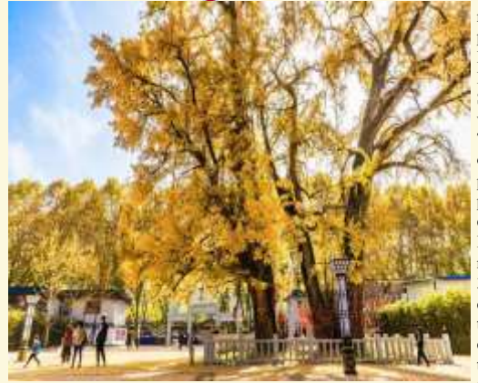
Henan Daily Zhengzhou: Ancient and notable trees are hailed as "green national treasures" and "living cultural

relics".How should they be protected? According to Henan Provincial Forestry Bureau on February 16, the Technical Specifications for the Conservation of Ancientand Notable Trees in Henan Province has officially been released as a provincial standard for their protection and will come into effect on April 20, 2025. Henan is rich inancient and notable trees, boastinga total of 319,461 suchtrees. This includes 32,954 scattered ancient trees and 777 ancient tree clusters of 286,507 trees in total. Henan ranks fourth in Chinain terms of the total