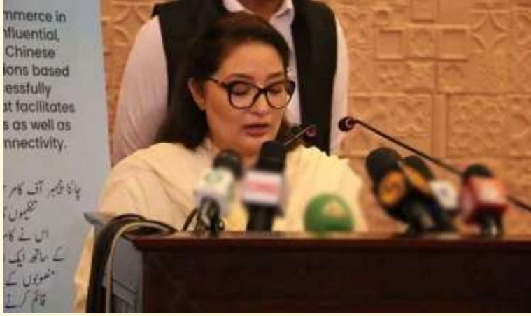
She reaffirmed the government's commitment to tackling climate challenges through the implementation of the National Climate Change Policy and the Pakistan Climate Change Act.