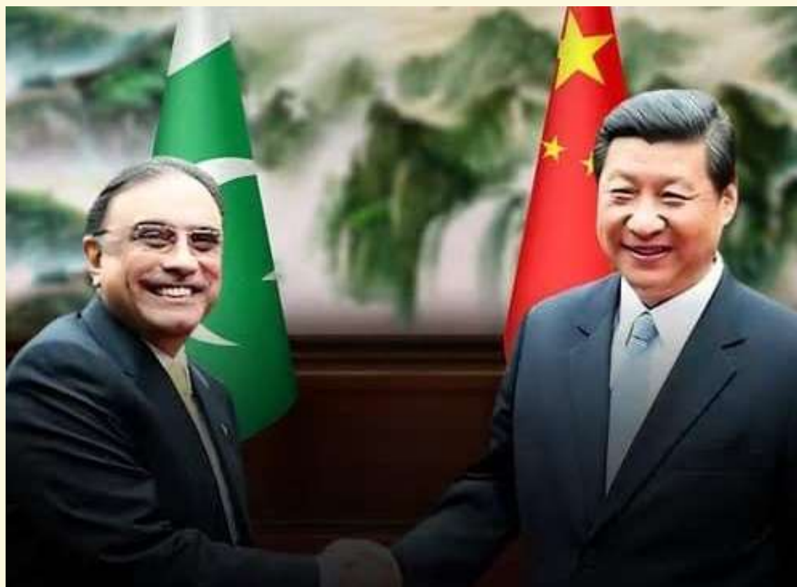
Islamabad: Pakistan People's Party (PPP) leader Umar Rehman Malik this week said that China is a time-tested friend of Pakistan.

"Heartfelt wishes to the great people of China for a prosperous and joyous New Year 2025. As we step into the Year of the Snake, may this year bring blessings of success, harmony, and well-being to