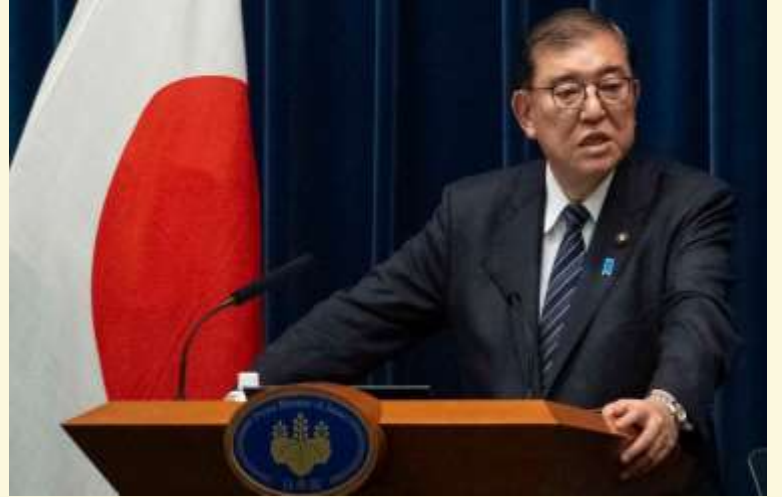
Yomiuri newspaper on Thursday. “Now matter how great our military tanks or vehicles are, it’s pointless if we don’t have enough people to move them,” said the prime minister, who has pledged to fix a shortage of new troops.

Covert Report Tokyo: Japan’s government this week approved a record budget for the next fiscal year, ramping up spending on social welfare, as the population ages, and defence to tackle regional threats. The 115.5 trillion yen ($730 billion) budget for the year from April 2025, green-lighted by the Cabinet, includes 8.7 trillion yen in defence spending. It also includes social security spending of around 38.3 trillion yen — up from 37.7 trillion the previous year. The defence ministry said in a briefing document that Japan was facing its