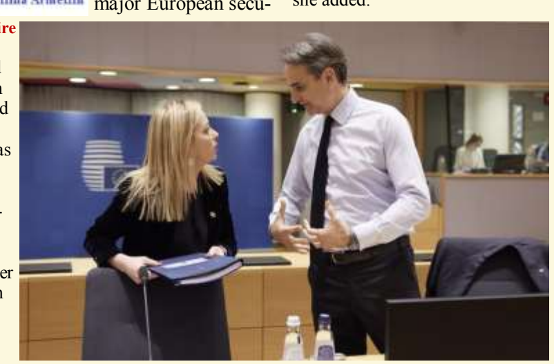
Weekly COVERT January 19 - 25, 2025

"Our two countries share a common geostrategic identity," Meloni said during her annual press conference, highlighting her strong working relationship with Greek Prime Minister Kyriakos Mitsotakis. "We collaborate on many issues with a shared ap-