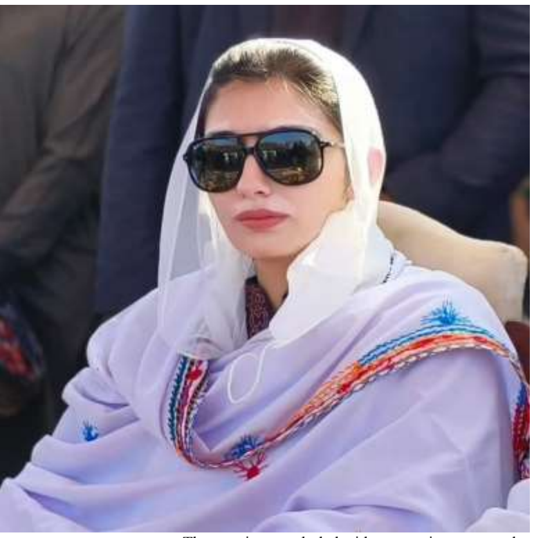
The meeting concluded with a commitment to tackle provincial issues collaboratively, ensuring that effective solutions are implemented for the benefit of the people of Khyber Pakhtunkhwa.

She acknowledged his efforts to promote women's empowerment, youth engagement, and interfaith harmony through measures spearheaded by the Governor's House in Peshawar.