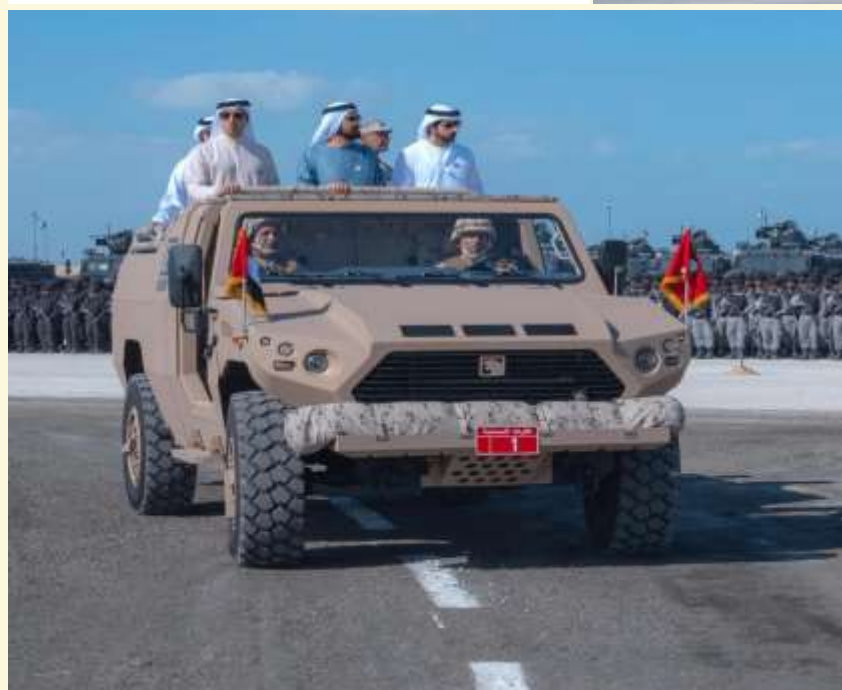
The Ambassador of the United Arab Emirates Islamabad-Pakistan H.E. Ibrahim Salem Alzaabi

Vibrant carnivals wind their way along the waterfront as colourful floats resplendent with images and effigies of Sheikh Zayed draw cheers. Often, beaches turn into outdoor galleries for the day with sand sculptures. To round up a day of celebrations, locals take to the streets to watch fireworks light up cities across the Emirates. Taking place annually in Abu Dhabi at Zayed Sports City Stadium, the official UAE National Day celebration is a theatrical extravaganza. A powerful show complete with aerobic displays, rousing performances and inspirational speeches; all imbued with a sense of national pride and courage. Underpinning the immersive event is the legacy of the UAE's founders, and their spirit that endures still today.