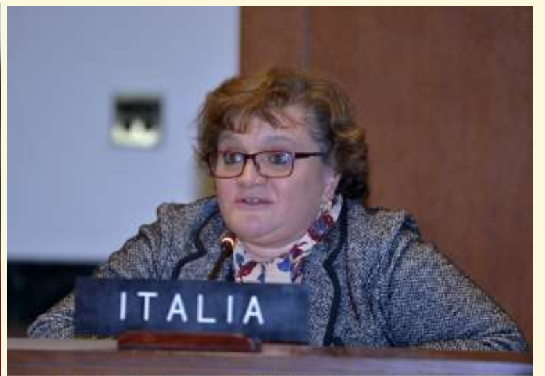
Italy's Ambassador to Pakistan Marilina Armellini

ed,” she said during a debate ahead of Thursday’s European Council summit. “The licenses authorized before are all being analyzed on a case-by-case basis by the competent authority at the foreign ministry.” “I want to recall that the Italian policy of completely blocking of all new licenses is