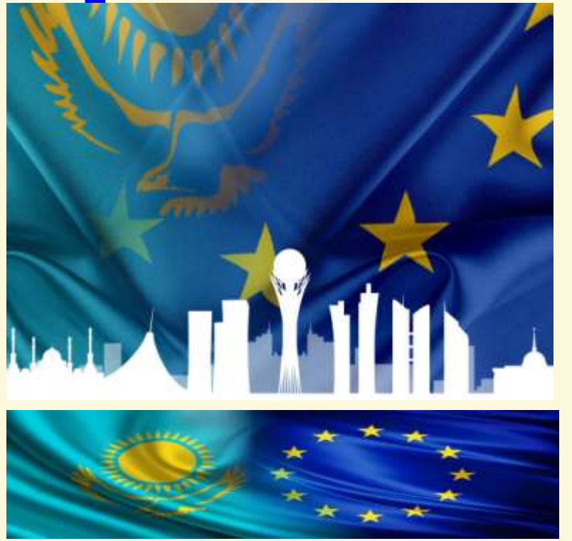
Celina Ali Union (EU) and Kazakhstan held its twenty-first meeting on Monday, 14 October in Luxembourg. During the meeting, both parties confirmed their commitment to deepening and widening their cooperation and to exploring the full potential of the Enhanced Partnership and Cooperation Agreement (EPCA). As Kazakhstan's first trade partner and foreign investor, the EU expressed strong support for the country's economic reform and political modernisation process. The EU underlined that the rule of law, good governance and fight against corruption are the very foundations of a functioning democracy,