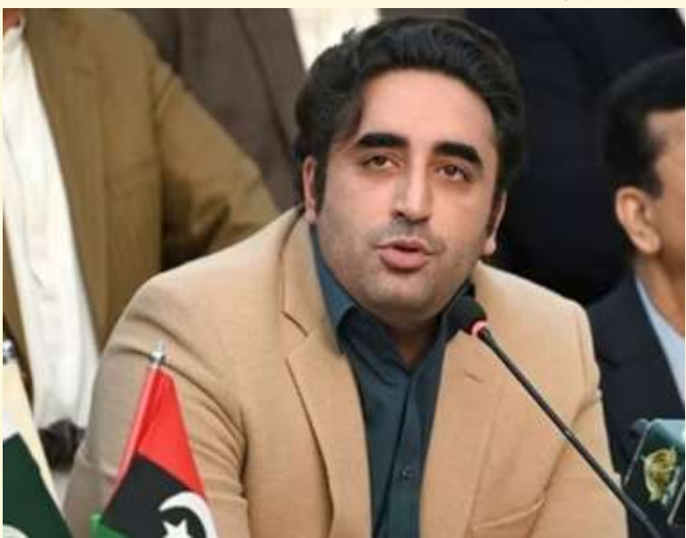
week said PPP chief Bilawal Bhutto Zardari's call for constitutional court was part of the PPP manifesto. "Bilawal Bhutto Zardari's call for constitutional courts aligns with the

for damaging the judiciary. He added that the judiciary has continuously launched attacks on the parliament. He emphasized the unique bond between the lawyers and the PPP, a connection that no politician or institution could claim.