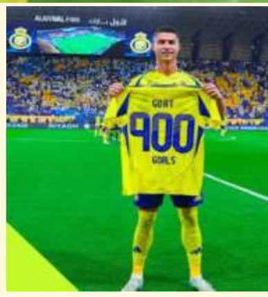
'GOAT' jersey by the club with the number 900 on the back. Ronaldo was given the memento on Friday, before kick-off for Al Nassr's match vs Al Ahli. There was also a tifo carrying messages like '900 goals' and 'Only heroes achieve glory'. Ronaldo's goal vs Croatia was a late winner, after he came on as a second-half substitute. In the 88th-minute with the score level at 1-1, Nuno Mendes whipped in a cross, which deflected off Diogo Jota's foot, and fell for Ronaldo, who converted it with ease for a 2-1 win. Portugal are on top of League A Group 1