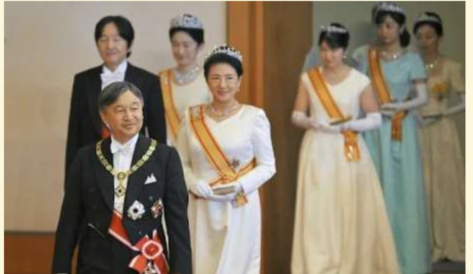
At the Akasaka estate in Tokyo, the statement said. A largely conservative government-commissioned panel of experts in January 2022 recommended that the government propose allowing female members to keep royal status after marriage as a way to prevent the declining population within the imperial family, while

An earlier proposal to allow an empress after Aiko's birth was shelved as soon as Hisahito was born in 2006. "Right now I would like to cherish my remaining time in high school," Hisahito said in a statement. He has long been interested in insects and even co-authored an academic paper on a survey of dragonflies on the grounds of his