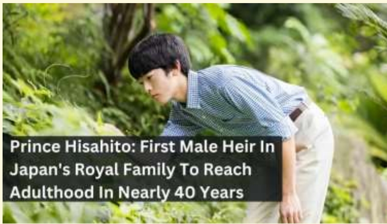
Prince Hisahito: First Male Heir In Japan's Royal Family To Reach Adulthood In Nearly 40 Years

adopting male descendants from now-defunct royal families to continue the male lineage with distant relatives. Critics say those measures would have a limited effect as long as the male-only succession is maintained because it was workable largely with the help of concubines in the pre-modern era.