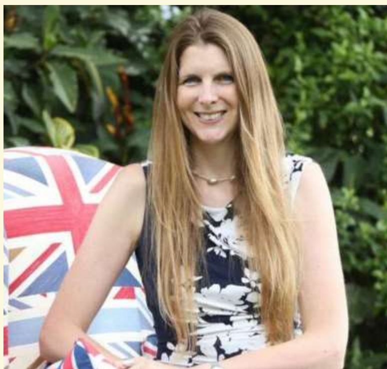
Celina Ali Islamabad: Deputy Prime Minister and Foreign Minister Senator Mohammad Ishaq Dar this week met the Deputy Prime

Minister and Secretary of State for Housing, Communities and Local Government of the United Kingdom Ms. Angela Rayner.