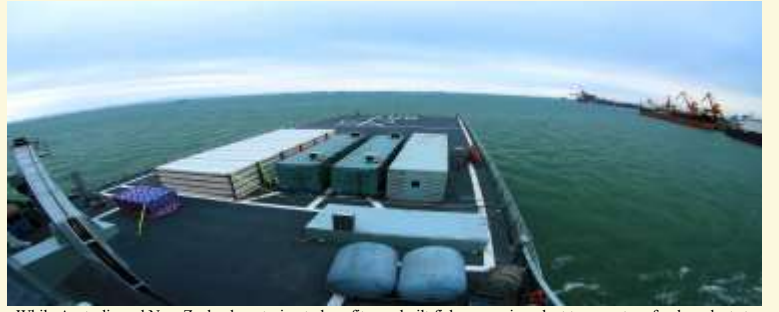
While Australia and New Zealand are trying to benefit from China's economic rise, calling it a "comprehensive strategic partnership," their leaders and think tanks come to the Pacific to warn the region of Chinese "debt traps" and security threats.

In June, Chinese Premier Li Qiang visited New Zealand and Australia. In New Zealand, the leaders of the two countries discussed enhancing their partnership through improving trade in services and goods, and intellectual exchanges. The same was agreed in Australia between the two countries.