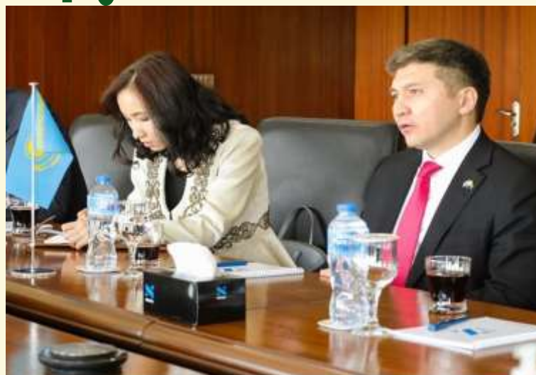
Ambassador of Kazakhstan to Pakistan, Amb. Yerzhan Kistafin

The bottom line is that “with rates as high as 18% linked to production (from 6%) and additional 2.5% linked to uranium prices, there would now appear to be less incentive to increase production in future year” and “while this could have as much as a 5-12% impact to future cash flow, increasing uncertainty over future supply could drive higher uranium prices”