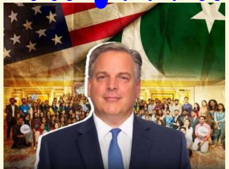
Funded by the US government, Fulbright academic exchanges enable students to attend top-tier universities, conduct groundbreaking research, share

The program in Pakistan is managed by USEFP, a binational commission established in 1950 by the governments of the US and Pakistan. To date, over 2,896 Pakistanis have received Fulbright awards, contributing to addressing shared international challenges.