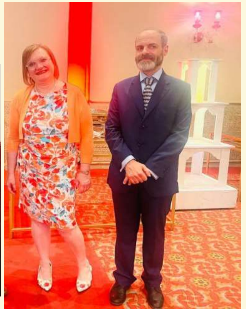
"Radio Education" project will use Interactive Radio Instruction to enhance after-school education

Their collaboration with UNESCO includes initiatives like "Support to Girls' Right of Education," which has enrolled 6,570 girls and trained 457 teachers in innovative methods. The upcoming