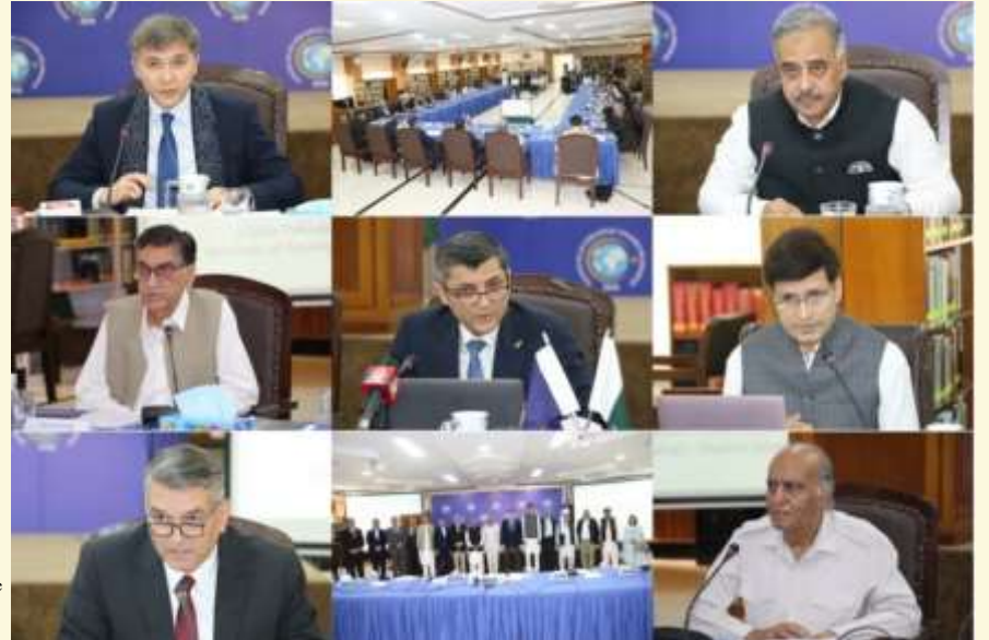
fostering security and economic cooperation among member states. He added that SCO is an organization focused on addressing diverse security challenges including terrorism, extremism, separatism, and non-traditional threats such as climate change and food security. Highlighting the upcoming Astana summit and the expansion of SCO membership to 10 states with the