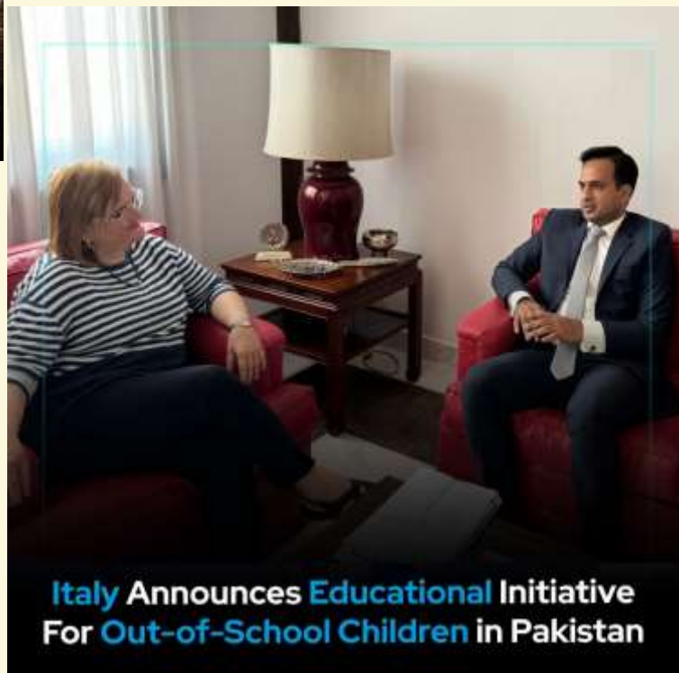
Italy Announces Educational Initiative For Out-of-School Children in Pakistan

vital roles of government, teachers, and parents in cultivating a robust educational ecosystem. She highlighted Italy's rich educational heritage and its support for Pakistan through UNESCO-backed projects, such as radio education in remote areas. The project aims not only to promote learning but also to empower com-