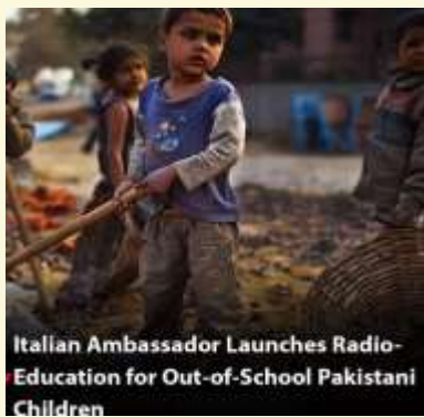
Italian Ambassador Launches Radio-Education for Out-of-School Pakistani Children